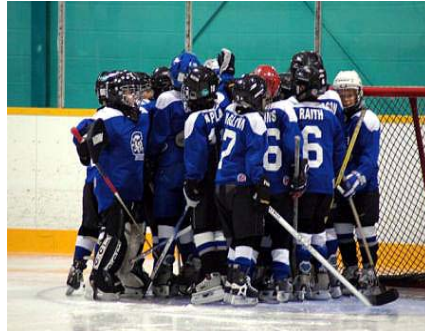
Teams for all over the World participate at the KIYHF

Your consideration to sponsor this on-of-a-kind event will be appreciated by your community! We are highly confident that the KIYHSF will continue to grow and develop into one of the most prestigious summer sports festivals in North America. With your help, KIYHSF will be able to flourish and generate positive benefits for Kingston's business community.